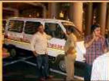
Turtles wrapped in plastic ... seized from Airport

Thane S.P.C.A. worked alongside Maharashtra Forest Department and Turtle Survival Alliance with Logistical support from RAWW India to repatriate scheduled Turtles to their habitat in a Northern Indian State. Read More