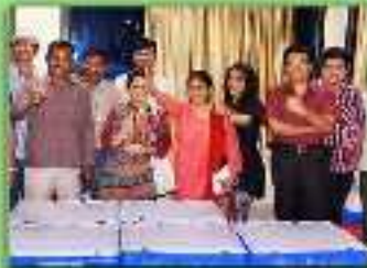
All Packed & Ready