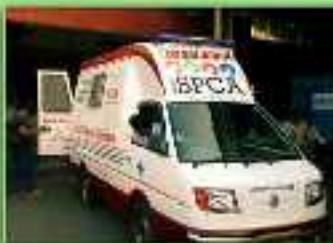
Unloading turtle containers of Airport Cargo

Thane S.P.C.A. worked alongside Maharashtra Forest Department and Turtle Survival Alliance with Logistical support from RAWW India to repatriate scheduled Turtles to their habitat in a Northern Indian State. Read More