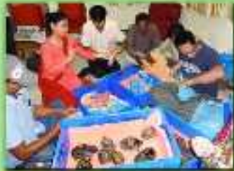
Packing & Stacking of containers for Air Cargo