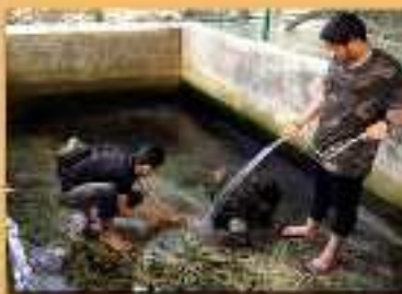
Preparations before release of rescued turtles